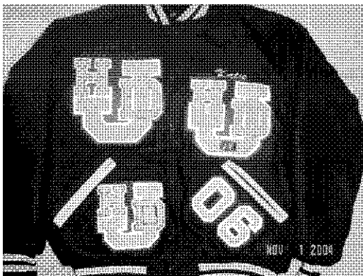
Front of a girl's jacket

- Captains of a team and other special patches are handed out for various reasons. Those are sewn on the sleeves and are awarded similarly to the letters.