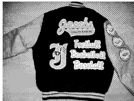
Back of a guy's jacket